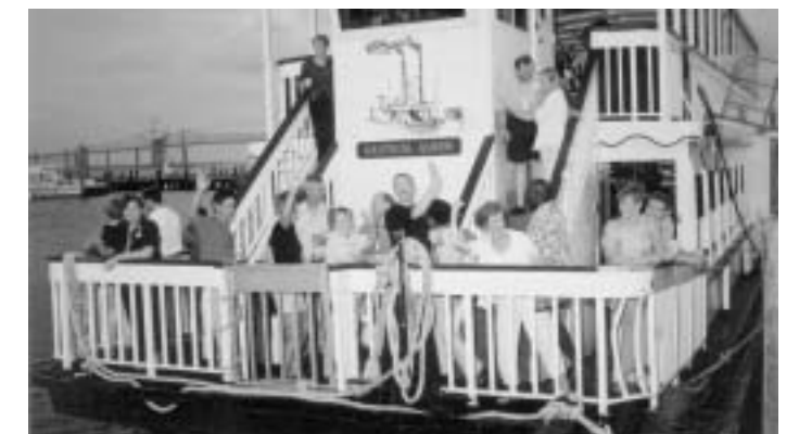
More than 100 members were on hand for the association's annual Harbor Cruise June 12.