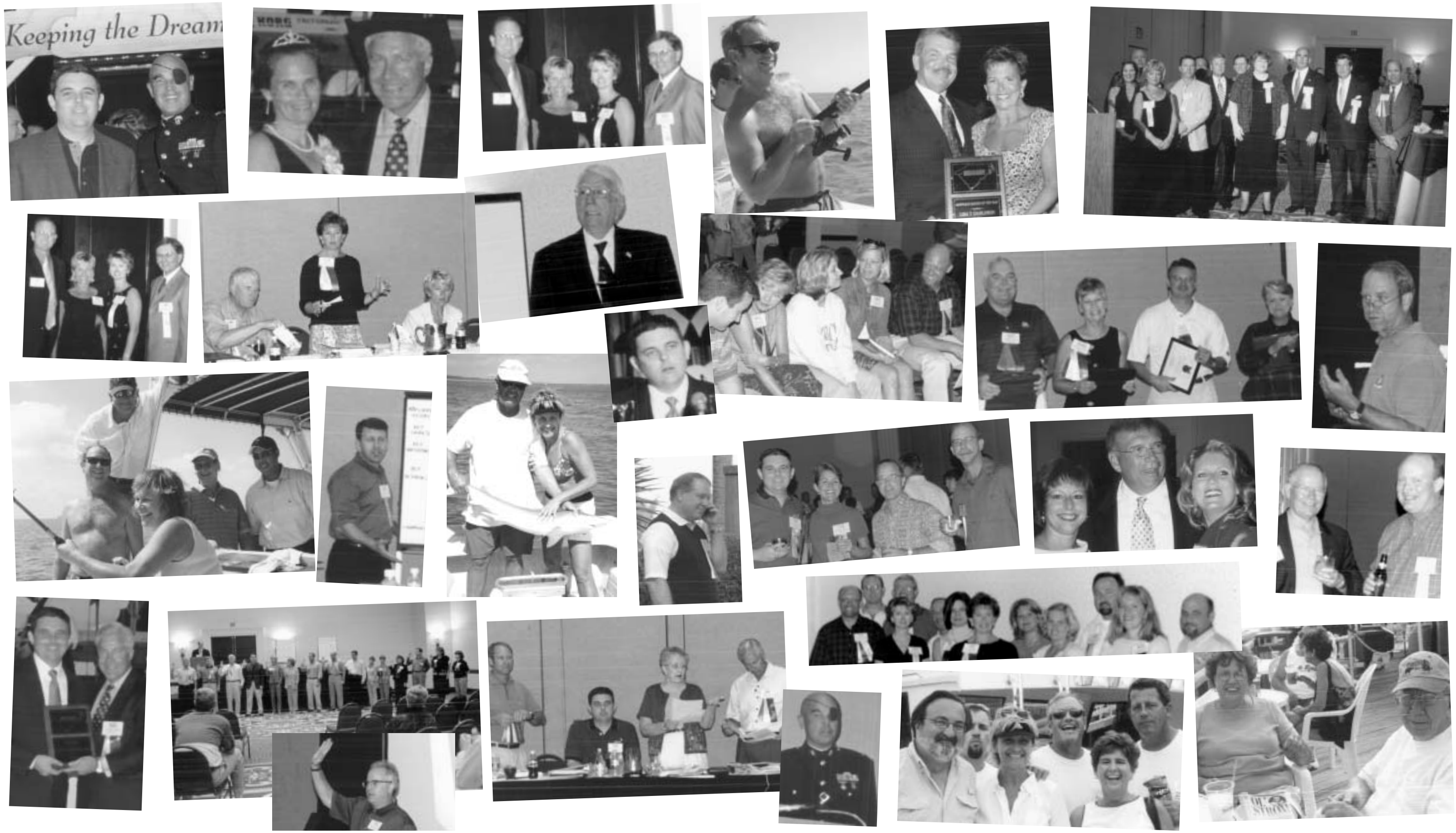
MBAC 48th Annual Convention • Hilton Head, South Carolina • September 2003