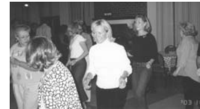
After plenty of barbecue and fixin's, members danced off some of the calories.