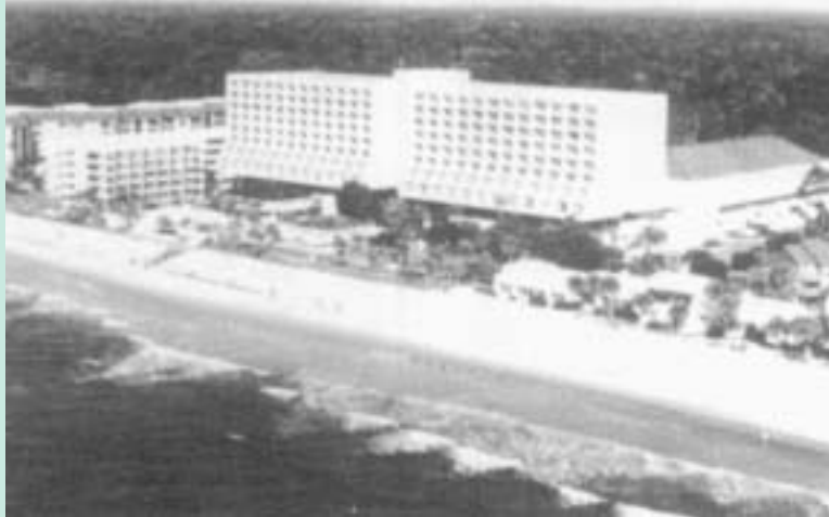
The Fabulous Kays

Watch your mail for further information.