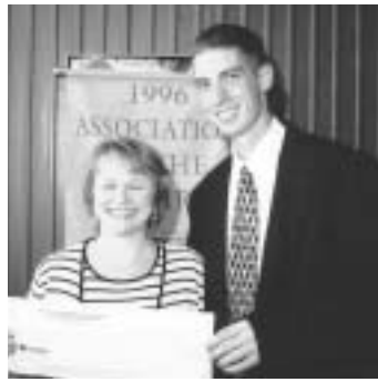
The MLAGC presented academic scholarships to three area students at its annual Scholarship luncheon April 18. The winners, shown here with